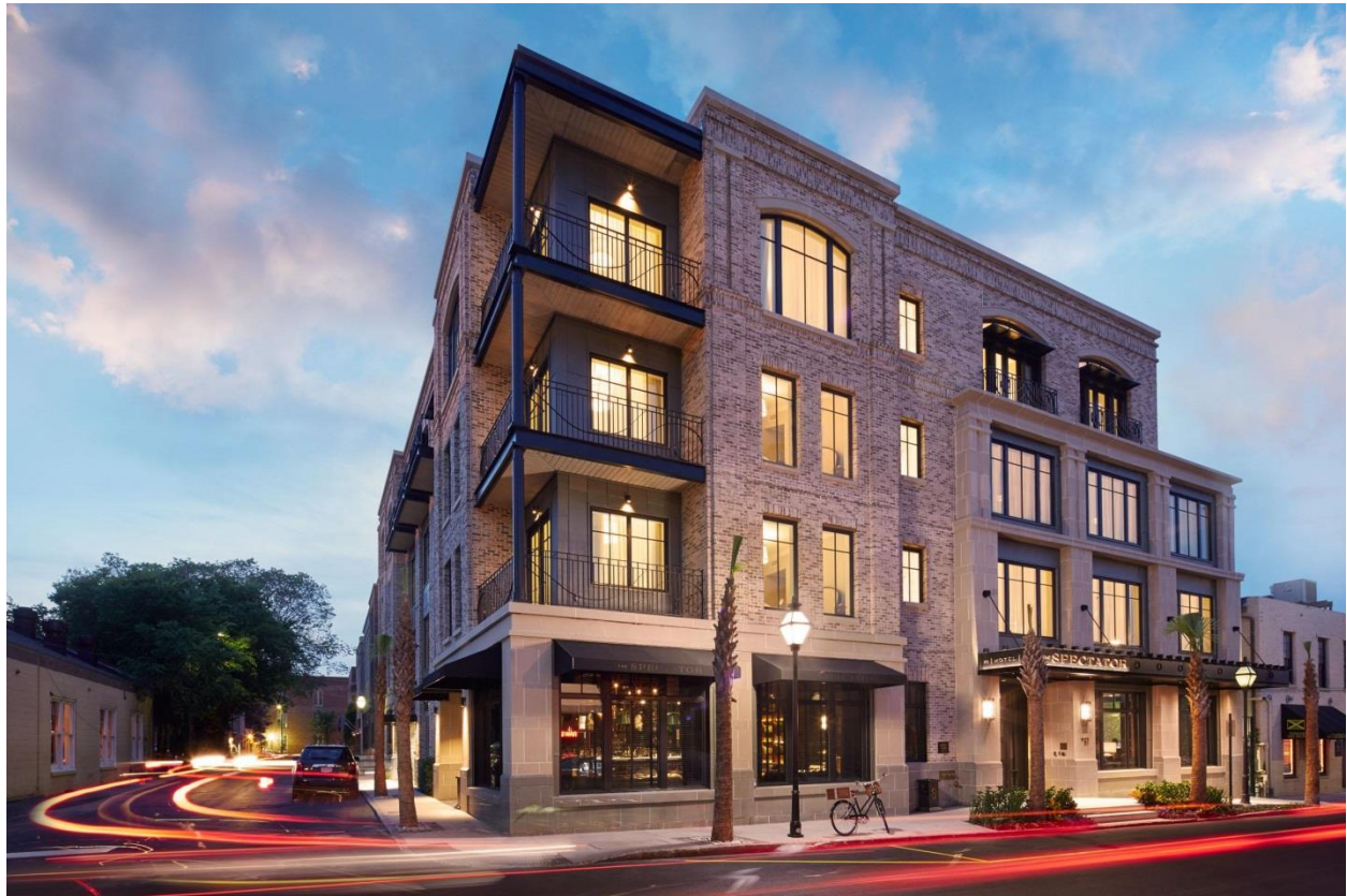
Hotel Haven downtown Helsinki Finland

If you have nothing to claim, you walk out the door. A driver in a very nice large Mercedes van is waiting for us; we load up and head to downtown Helsinki and the Hotel Haven a 30 minute drive.