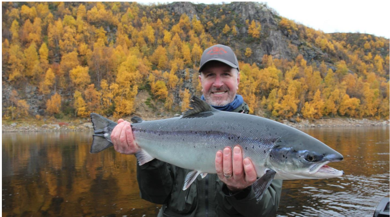
A Great Trip!

Ryabaga Camp on the Ponoι River is a deluxe fly fishing property, extremely well financed and staffed. The food service is what you might find in a fine restaurant. Nothing is left to chance and there are spares for everything – no down time due to potential mechanical issues. If you are looking for a high-end fishing destination, with every available amenity, including reliable internet service, in an extremely remote location, this is the destination to consider.