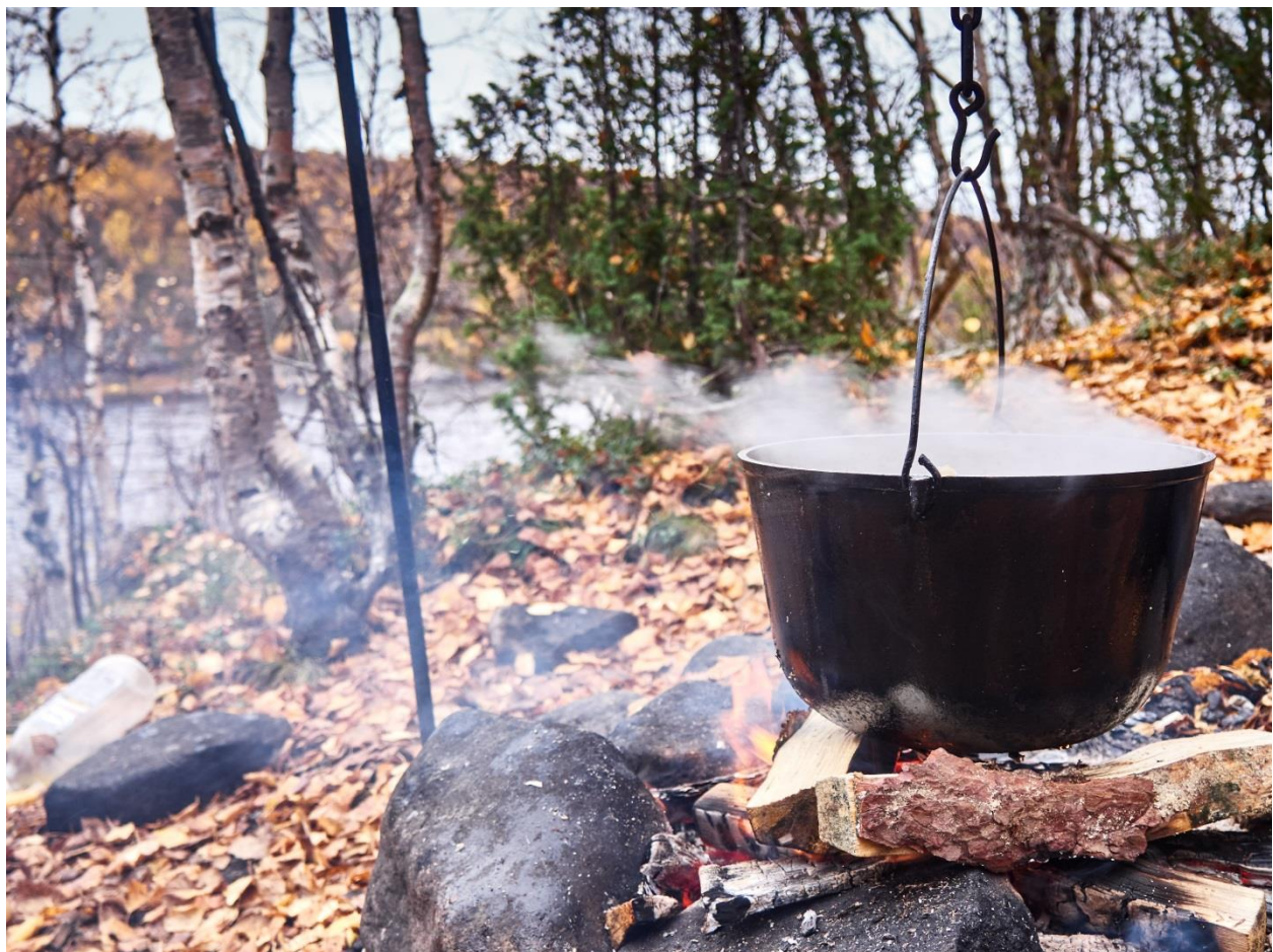
Fish Head Stew boiling in the pot