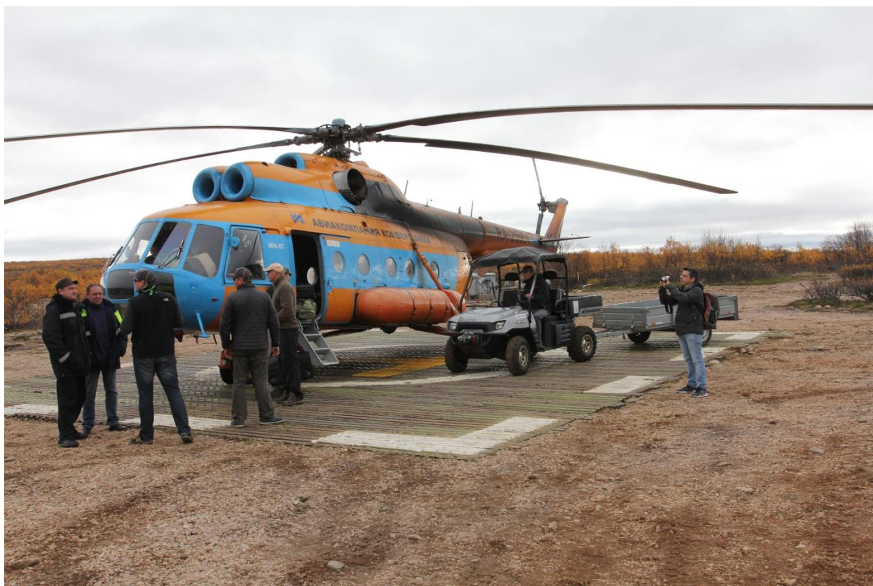
Landing Pad at Ryabaga Camp