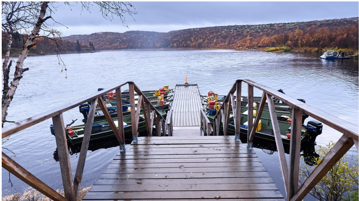
Dock with hovercraft in background

Fun Facts: We are 200 kilometers above the Arctic Circle and 2,652 kilometers and change from the North Pole. A grilse by definition is an Atlantic that spends one year at sea and returns to a river.