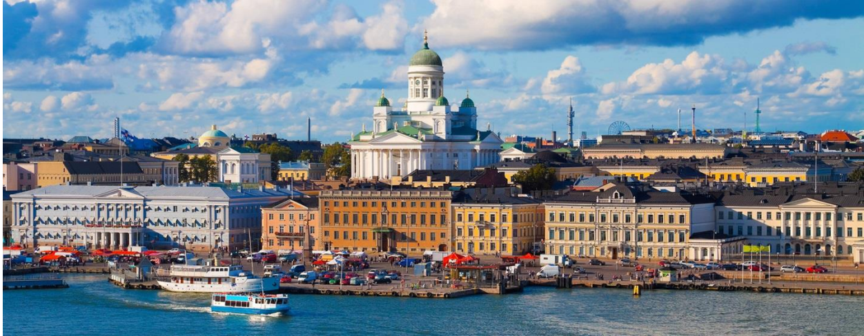
Helsinki is a beautiful old world city