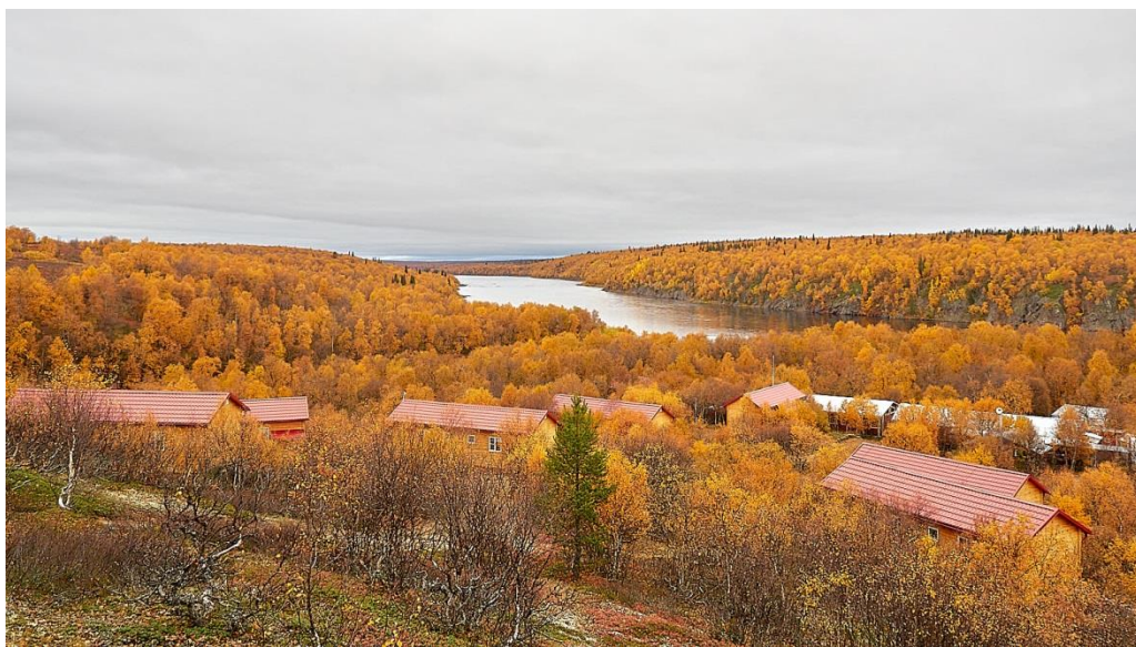
Ryabaga Camp on the Ponoï River