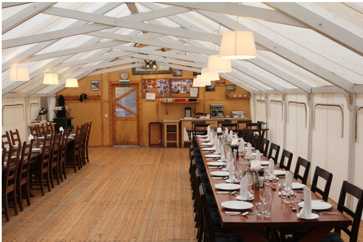
The Lodge and Dining Room at Ryabaga

151 salmon were landed today, top boat was us. Nice dinner, Shushi for appetizers and for dinner we started with a meatball soup, followed with a salad with chicken, with the main course halibut and scallops. Dessert was chocolate mousse with white chocoholic shavings and nice Argentina Malbec. A biologist from Murmansk gave a nice presentation on the river and fish, about 35,000 fish come up the river each year and the run is on a seven year cycle. Tomorrow we fish with Augustine from Argentina.